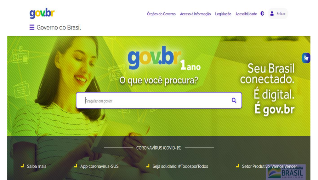
Figure 4 - Home page of Gov.br

The platforms object of this study are: the Secretariat of Digital Government (SGD) "Gov.br", the ABDI "EPIMatch" and the IFCE "FiquenoLar". Gov.br (Figure 4) provides digital identity and digital services to citizens, EPI Match (Figure 5) facilitates the connection among demand and supply of personal protective equipment (PPE, which's acronym in Portuguese is EPI) and FiquenoLar (Figure 6) displays information about the local business to consumers that were advised to shelter in place in the context of the pandemic.