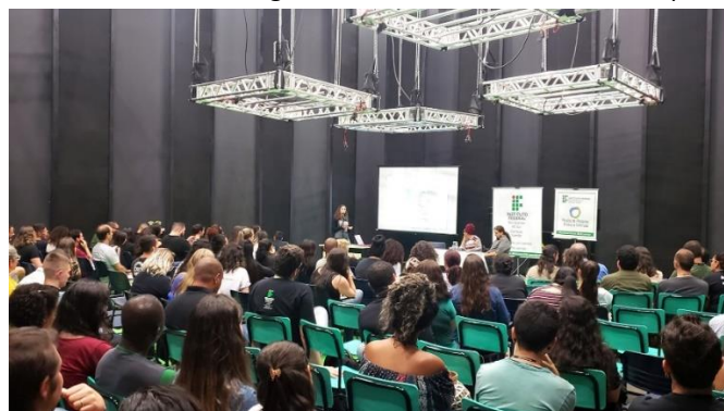
Figure 1 – Research, Teaching and Outreach III Exhibition, Campus Viamão

The Research, Teaching and Outreach III Exhibition in the Federal Institute of Rio Grande do Sul, Campus Viamão (Figure 1), held on 18, 19 and 20 October 2018, was an event integrating scientific, technological and cultural events, and presented the central theme “Science Reducing Inequalities”.