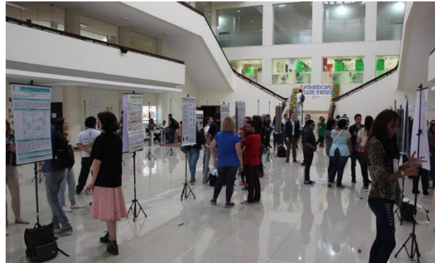
Figure 2 – IFRS 19 th MostraPoA - Campus Porto Alegre