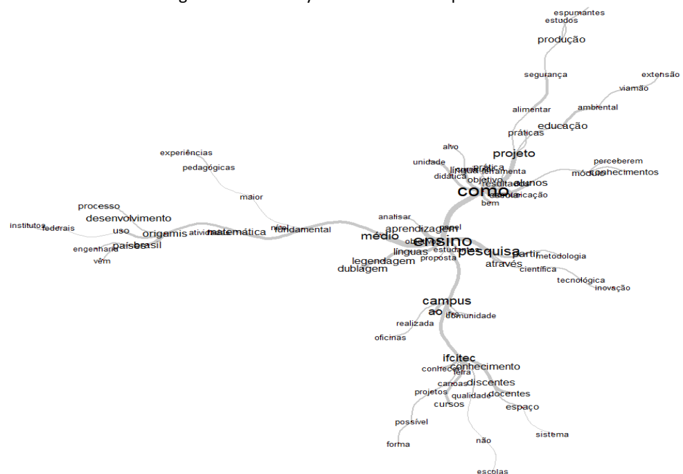
Figure 4 – Similarity tree of the works presented

When incidence was analyzed, the words teaching , how , and research presented greater frequency and from these terms, the occurrence of other words that are also important in scientific initiation is observed, namely, production, project, student, campus, practical and knowledge.