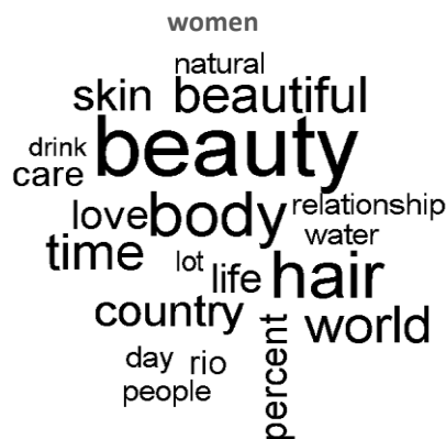
Figure 3- Word clouds most cited in the discourse of European countries about Brazilian women

It follows an estimate in the form of "word clouds," in which the scale of the source of each word is proportional to its frequency (Figure 3). Media discourses relate the physical characteristics and specific patterns of the beauty of Brazilian women to body worship and aesthetic surgeries, performing physical exercises and healthy eating practices with local fruits and vegetables, and tanning of the skin. This "modeling appearance" in addition to representing an ideal of beauty is also referred to as a stereotype of health, youth, and success, of how a healthy and thriving body should be.