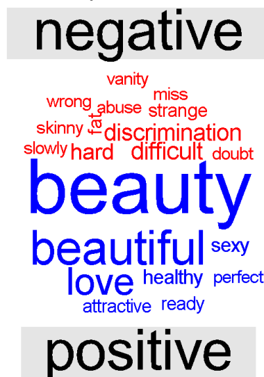
Figure 4 - Analysis of positive and negative feelings in the words most found in the discourse of different European countries about Brazilian women

They are the beauty goddesses and show the rest of the world how they do it. Brazilian women are proud of their brown curves, show their long hair, and impose beauty trends around the world. (M17, SPAIN, 05/08/2016).